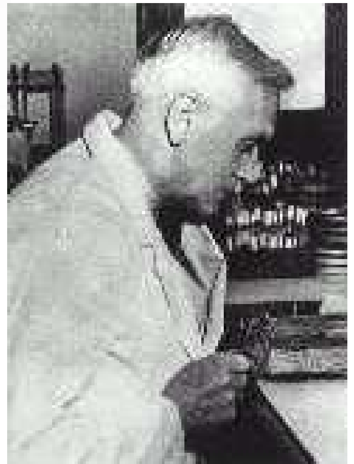
ANTIBIOTICS discovered by SIR ALEXANDER FLEMING