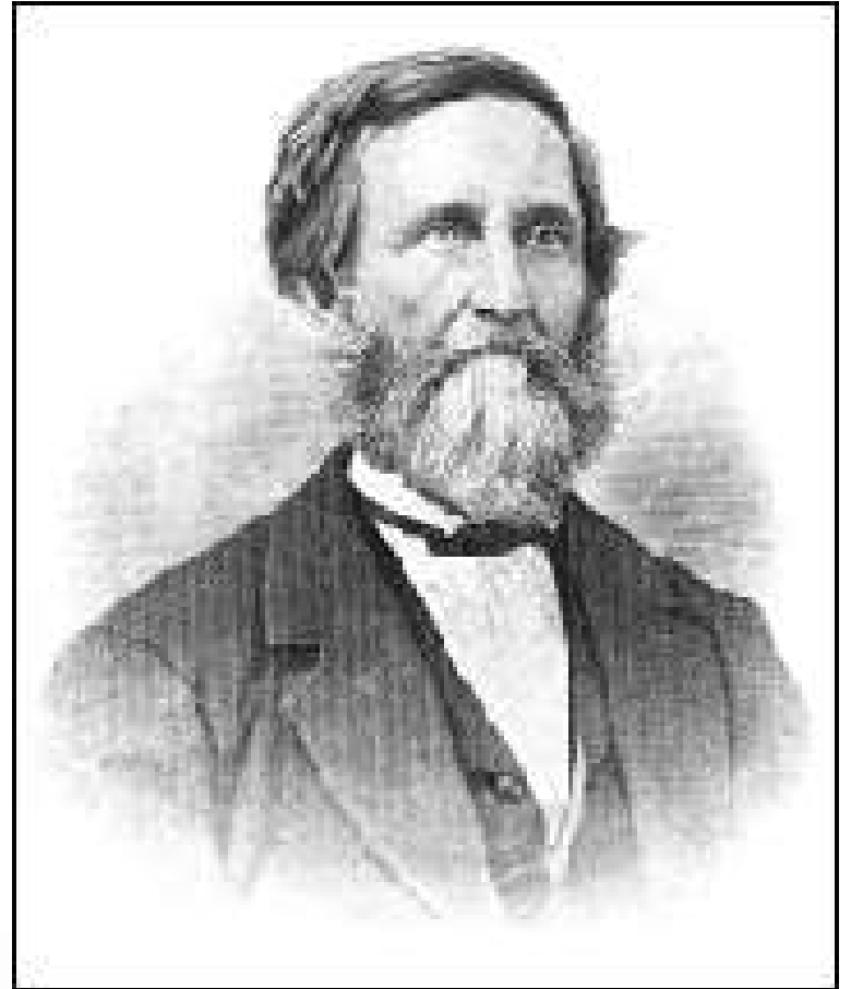
ANAESTHESIA used first by DR CRAWFORD LONG