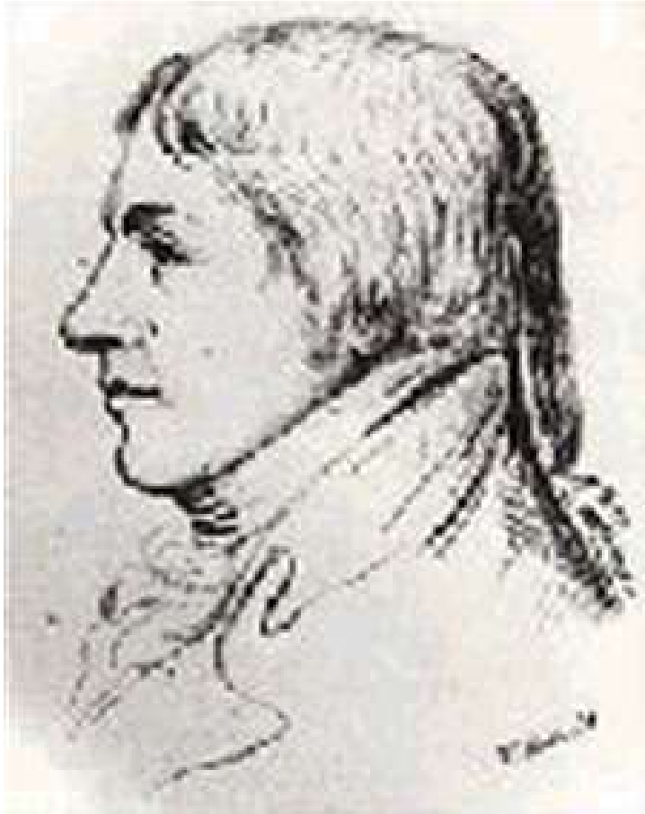
VACCINATION invented by EDWARD JENNER

4 Freemasons discovered and developed 4 of the most major advances in Medical History, and another founded one of the World's greatest humanitarian organisations.